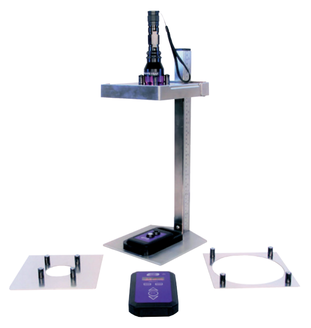
DAILY CHECKS CAN BE DONE WITH OLYMPOS MEASUREMENT STAND (P/N: A542)